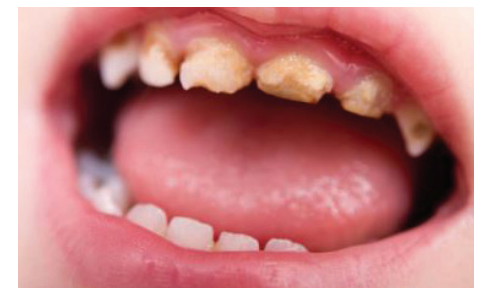
To find a dentist, see map on back